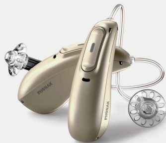
Fitted with Phonak Audéo M90-R